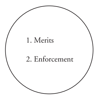
FIGURE 1: "CONVENTIONAL LITIGATION": ONE JURISDICTION FOR ALL STAGES OF LITIGATION

Plaintiffs wishing to select the law and forum that will apply to their transnational cases have options. A rational plaintiff will bring the merits, recognition, and enforcement stages of her lawsuits in those jurisdictions that will maximize her chance at (and amount of) recovery, less litigation costs. 77 Thus, a plaintiff in a transnational lawsuit now shops in three stages. She first selects a forum in which to file her merits lawsuit. If successful in winning a judgment, she then selects a forum in which to bring an action to recognize the foreign judgment. Because American courts apply the substantive and procedural recognition rules of the state in which they sit, the plaintiff's choice of a recognition court decides not only the forum but also the governing law of the dispute. Third, the plaintiff chooses a forum in which to bring an action to enforce her U.S. judgment. Finally, none of these three forums need be the same as any other. Figures 1, 2, and 3 illustrate these possibilities, with each circle representing a single jurisdiction.